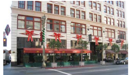
Good examples of buildings that promote sidewalk activity with overhangs, awnings and other transitional elements integrated into the architecture.