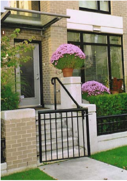
Good example of individual unit entry several feet above the sidewalk with porch and windows that look onto the street.