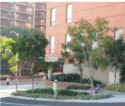
Where blank walls are unavoidable, they can be set back with landscaping.