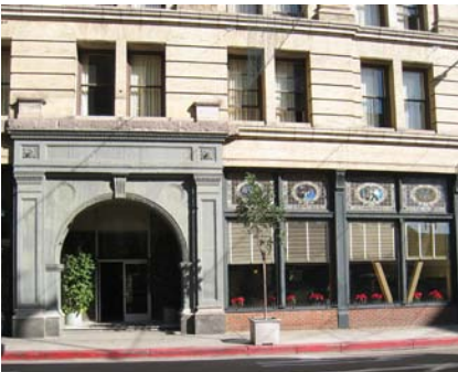
Common areas or recreation rooms with transparent windows can also line the ground floor of residential buildings.