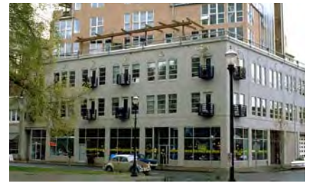
Zero setback with ground-floor retail.