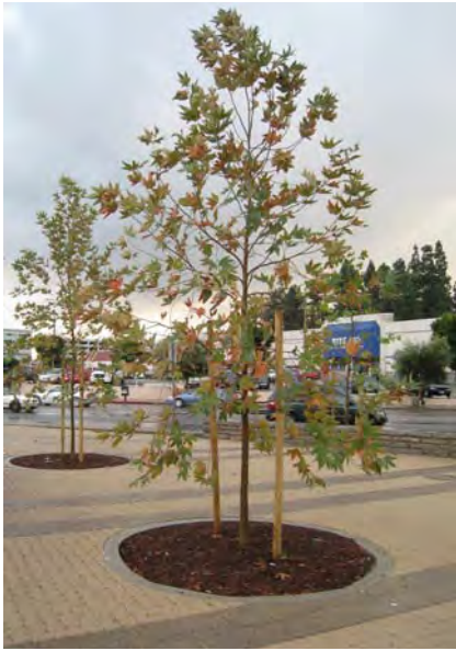
Tree with large tree well surrounded by permeable paving with gap graded soil to store and infiltrate stormwater beneath.