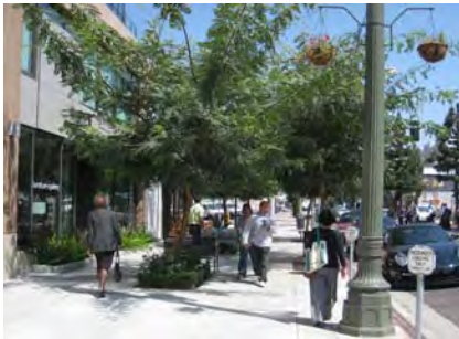
Where average 24' wide sidewalks are required, as on Grand Avenue in South Park, a double row of trees is also required.