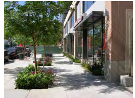
A small setback with a little landscaping next to professional office or live-work space.