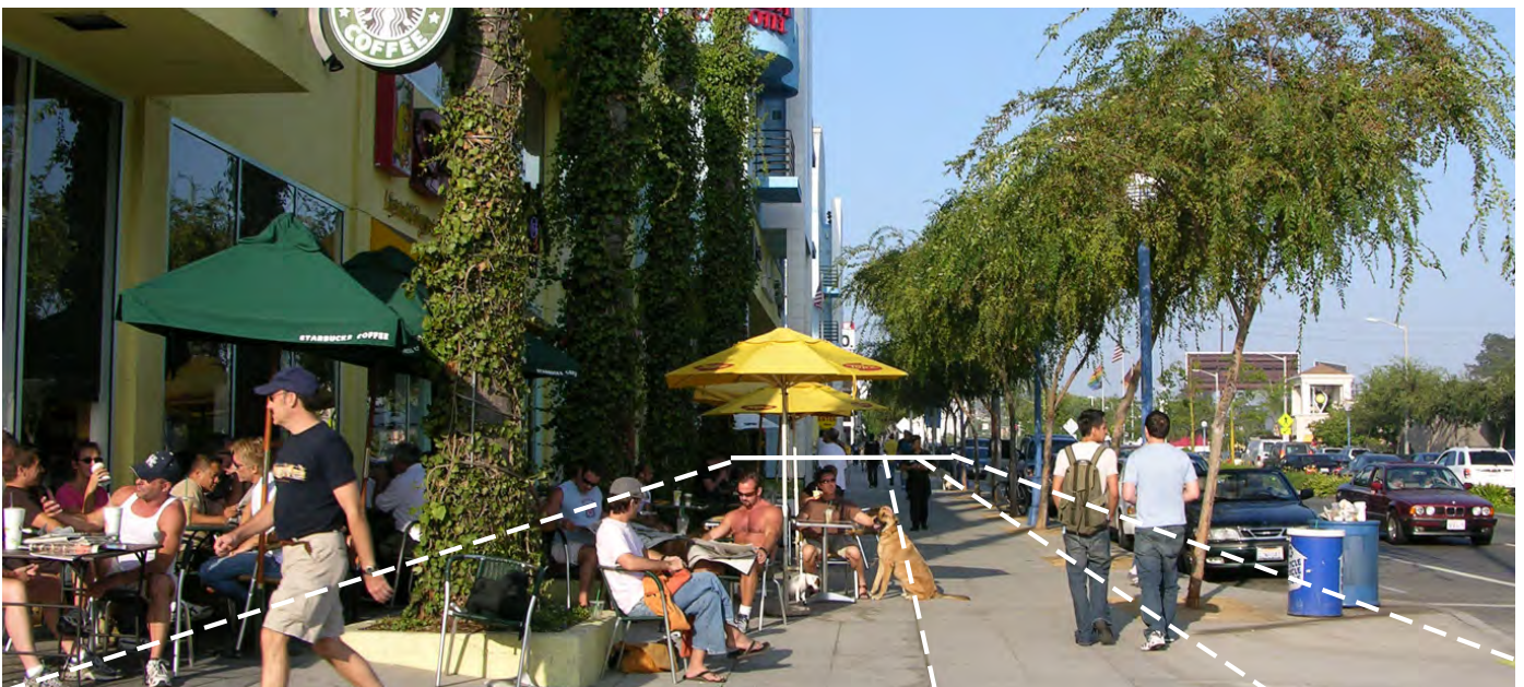
OUTDOOR DINING, ETC.