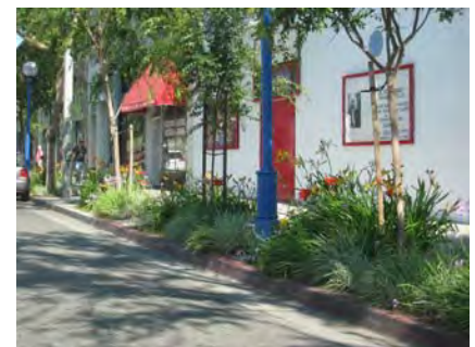
All continuous landscaped parkways collect stormwater runoff from the sidewalk.