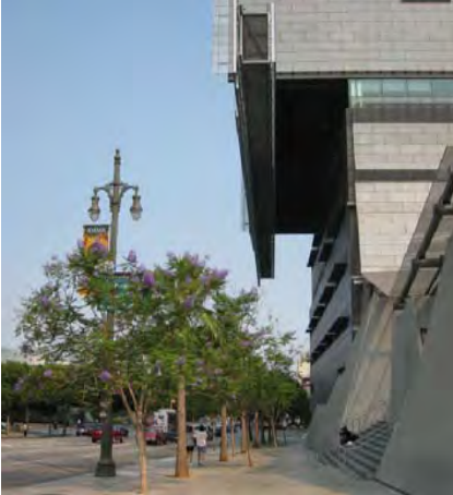
Example of building overhang that does not interfere with street tree growth.