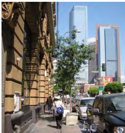
Where narrow sidewalks or basements prohibit in-ground trees, planters may be used.

Where it is not feasible to plant street trees in continuous landscaped parkways, provide large street wells with gap-graded soil beneath the sidewalk.