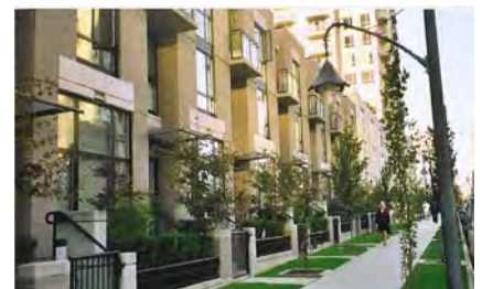
Housing with front yards and secondary entrances along the sidewalk.