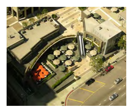
Good example of a commercial corner plaza.

* minor deviations of up to 2 vertical feet from sidewalk level are permitted