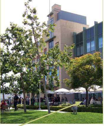
Central common space nestled between two buildings