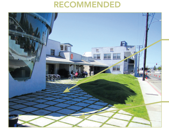
Provides a sense of enclosure while maintaining openness to the street